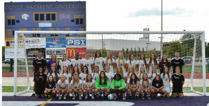
2017 CCAC Championship Team

6 NAIA National Tournament Appearances 1 NAIA National Runners up 2012 5 NCCAA National Tournament Appearances 1 NCCAA National Championship 2008 1 NCCAA National Runners up 2009 20 NAIA and NCCAA All Americans 6 Regular Season CCAC Championships 6 Conference Tournament Championships 79 All Conference players 78 NAIA Scholar Athletes NAIA Top 25 7 consecutive years Coach Bahr 6th in NAIA for All Time Winningest Active Coaches 263 wins 128 losses 29 ties .666 winning percentage